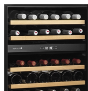
Wooden drawing shelves