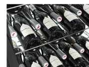
Wine shelves as option