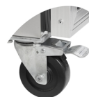
Castors with and without brake