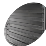
Guides for Bakery trays