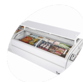
Shelf as accessory