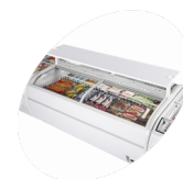
Shelf as accessory