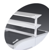
Promotional shelves as accessory