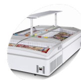
Island installation, shelves as assessor