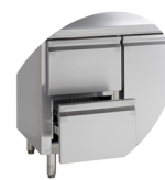
Drawers available as separate kit