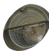
Internal fan and basket