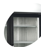
Vertical internal light