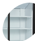
Vertical internal light