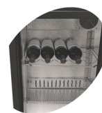
Wine shelves as option