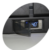
Protective thermostat cover