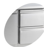
Drawers as option