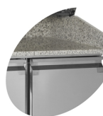
Granite table top