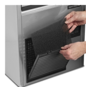
Easy to clean condenser filter