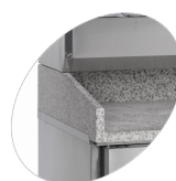
Granite table top