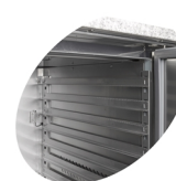
Guides for pizza trays