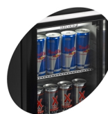
Designed for Energy-cans