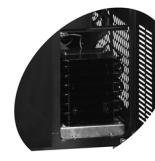
Easy access to clean condenser