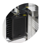
Easy access to clean dust filter