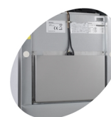
Automatic defrost system