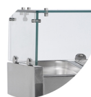
Glass structure as option