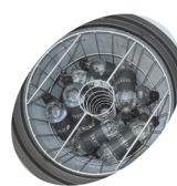
Internal fan and basket