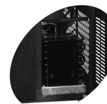
Easy access to clean condenser