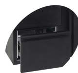
Drawers as option