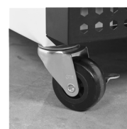
Strong castors as option