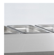
Accepts GN1/4 pan(s) (not supplied)