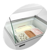
Scooping basket option